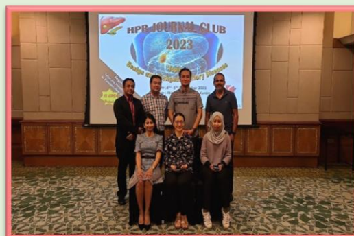
Figure 1: HPB team Selayang Hospital.

The Hepatopancreatobiliary (HPB) Journal Club was held on 4 th and 5 th November 2023 at the Mandarin Oriental Hotel Kuala Lumpur. The setting of the luxurious Mandarin Oriental provided an elegant backdrop for the gathering of esteemed HPB surgeons and trainees. This time around, the journal club topic focused on “Benign and Malignant Biliary Diseases”. The sessions were meticulously organized by the Selayang Hospital HPB team in collaboration from the Malaysian Society of Hepatopancreatobiliary Surgeons (MyHPBS) and the support from various industrial partners.