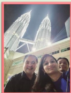
Figure 8: Local site seeing.