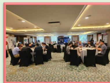
Figure 7: Lunch Buffet.

The attendees were provided with sumptuous meals throughout the two-day event including welcome refreshments, breakfast buffet and lunch buffet. At the end of Day 1, the attendees were treated with an exquisite dining experience at the Imperial Chakri Palace at KLCC which featured traditional Thai cuisine. The attendees also had the opportunity to indulge in some local site seeing in the heart of Kuala Lumpur.