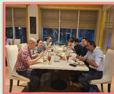
Figure 9: Dinner at the Imperial Chakri Palace.