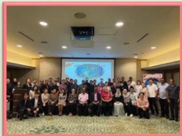
Figure 11: Group photo.