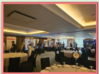
Figure 6: Exhibition booth.