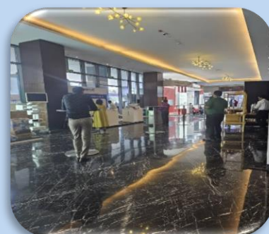
Figure 2: Exhibition hall.

The venue itself was impressive, providing a conducive environment for learning and networking. The conference halls were abuzz with discussions, presentations, and workshops covering a wide spectrum of topics. Moreover, the exhibition area was bustling with pharmaceutical companies, medical device manufacturers, and healthcare organizations showcasing their latest products, technologies, and services.