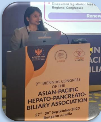
Figure 6: Oral presentations.

This congress was an indeed an enlightening experience full of knowledge and memorable moments which brought together delegates and leading experts in the HPB fraternity from across the Asia Pacific region and beyond, creating a dynamic platform for sharing knowledge and advancements in the HPB field.