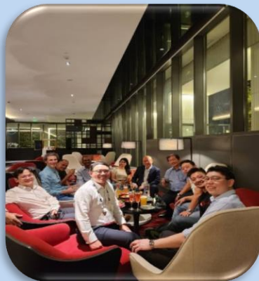
Figure 8: Social gathering with other delegates

This congress was an indeed an enlightening experience full of knowledge and memorable moments which brought together delegates and leading experts in the HPB fraternity from across the Asia Pacific region and beyond, creating a dynamic platform for sharing knowledge and advancements in the HPB field.