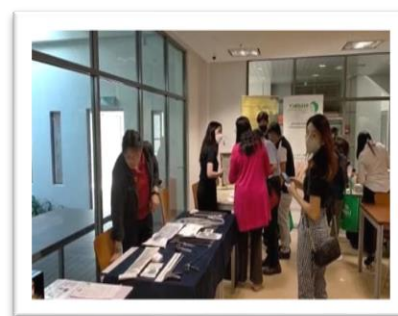
Figure 10: Various exhibition booths.

The event was a success due to the dedication of all primary care doctors, relentless committee members, presence of distinguished speakers and not to forget the support of our various industrial partners.