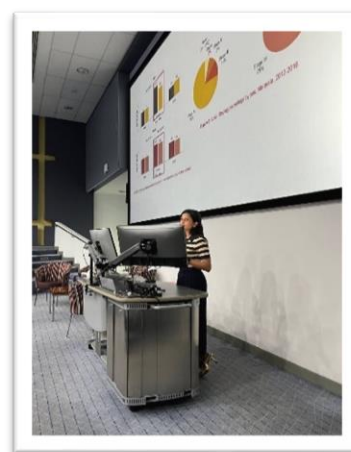
Figure 7: Speaker from Sultanah Aminah Hospital.