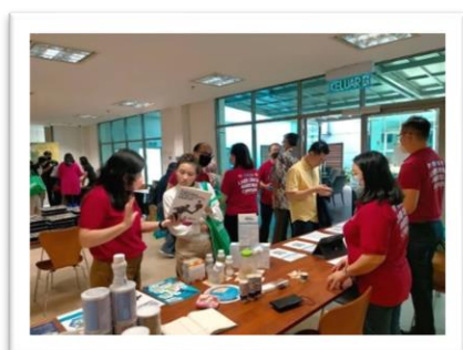
Figure 8: Participants visiting the exhibition booths.