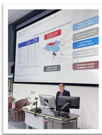
Figure 6: Speaker from Sultanah Ismail Hospital.