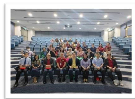
Figure 2: Committee members.