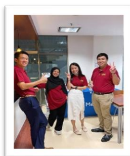
Figure 9: Industrial partners.