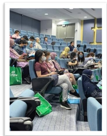
Figure 5: Audience.

There was also an open dialogue session held to address the frequently asked questions by the primary care doctors.