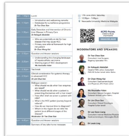
Figure 1: Programme schedule and speakers.